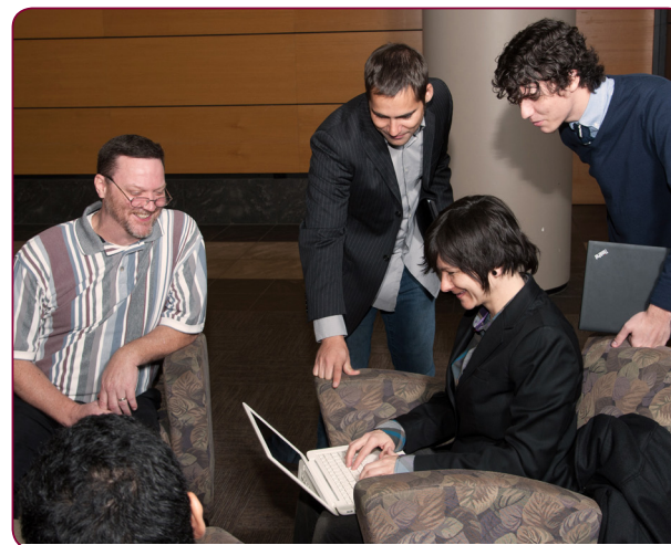
Students interact with Microsoft Technical Evangelist Paul DeCarlo.

In the program you will develop marketable technical and decision-making skills in all functional areas of business.