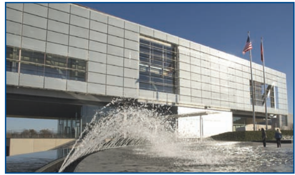
William Jefferson Clinton Presidential Library

The River Project area of downtown Little Rock is a good example of successful redevelopment of an area that had been declining for decades. Community leadership adopted a shared vision and shared goals to make the