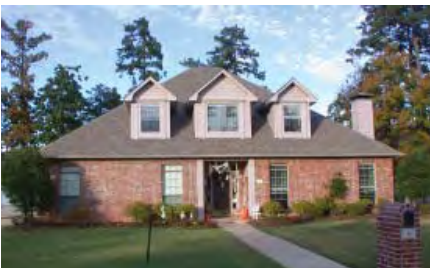
Traditional neighborhood single-family housing

The dominant characteristics of the larger UD are its traditional people-scaled neighborhoods that are interspersed by active and resource parks, the Coleman and Rock creek waterways, local schools and houses of worship, and the UALR campus. Unfortunately, many in the metropolitan region view district's dominant characteristic as a pass-through corridor lined with unsafe and obsolete shopping center 'strip-malls' with large expanse of bleak, un-landscaped asphalt parking areas.