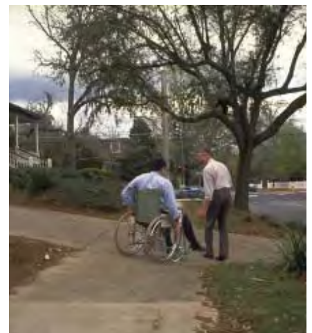
Limited access neighborhoods