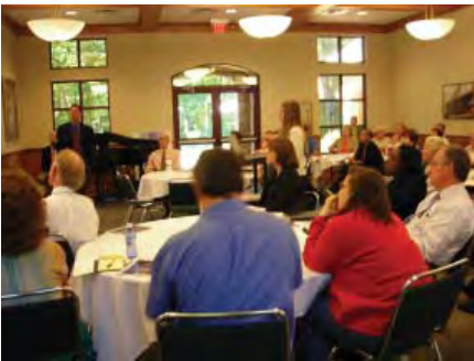
UD Partnership Workshop

The plan was developed in close coordination with numerous local, regional, and state participants that included, but were not limited to, the: