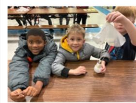
The second-grade team at Bayou Meto recruited their school custodian to help test their parachute designs.