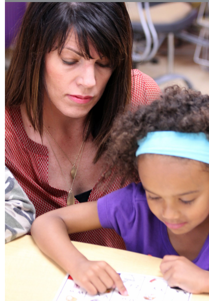
Reading Recovery teacher works with a student in Nixa School District, MO.