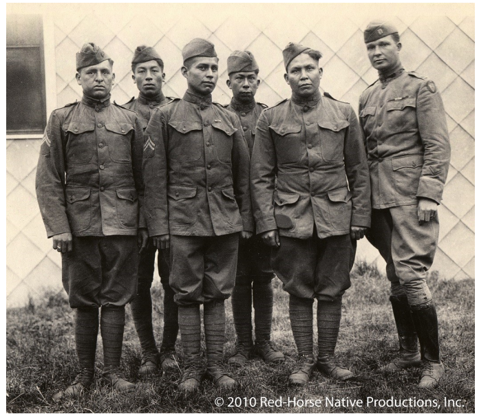
Choctaw Code Talkers during WWI.

For more information and details, please contact Erin Fehr (501)569-8336 or ehfehr@ualr.edu or visit our website: ualr.edu/Sequoyah .