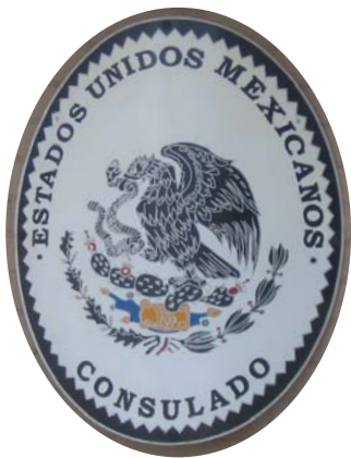
The Mexican Consulate located on South University Avenue serves five states in the region.

University District Cultural Identity. The University District population includes more racial, ethnic, and cultural diversity than most other areas of the Little Rock Metropolitan area. UALR students, faculty, and staff represent over 32 nationalities, and the neighborhood and businesses include several Asian and Latino enterprises. In addition, the Mexican Government chose to locate its Consulate in the University District across University Avenue from the west entrance to the UALR Campus. The Consulate opened April 25, 2007 and serves all of Arkansas and Oklahoma and portions of Missouri, Tennessee, and Louisiana. The Consulate will serve Mexican nationals and U.S. citizens and businesses that have business and personal transactions in Mexico. The presence of the Consulate should bring even more Latino influence to the District. In addition to providing a focal point for ethnic diversity, UALR offers central Arkansas important cultural resources, including visual and performing arts, academic experiences, exhibits and events, and intercollegiate sporting events. These cultural resources are major assets for the University District.