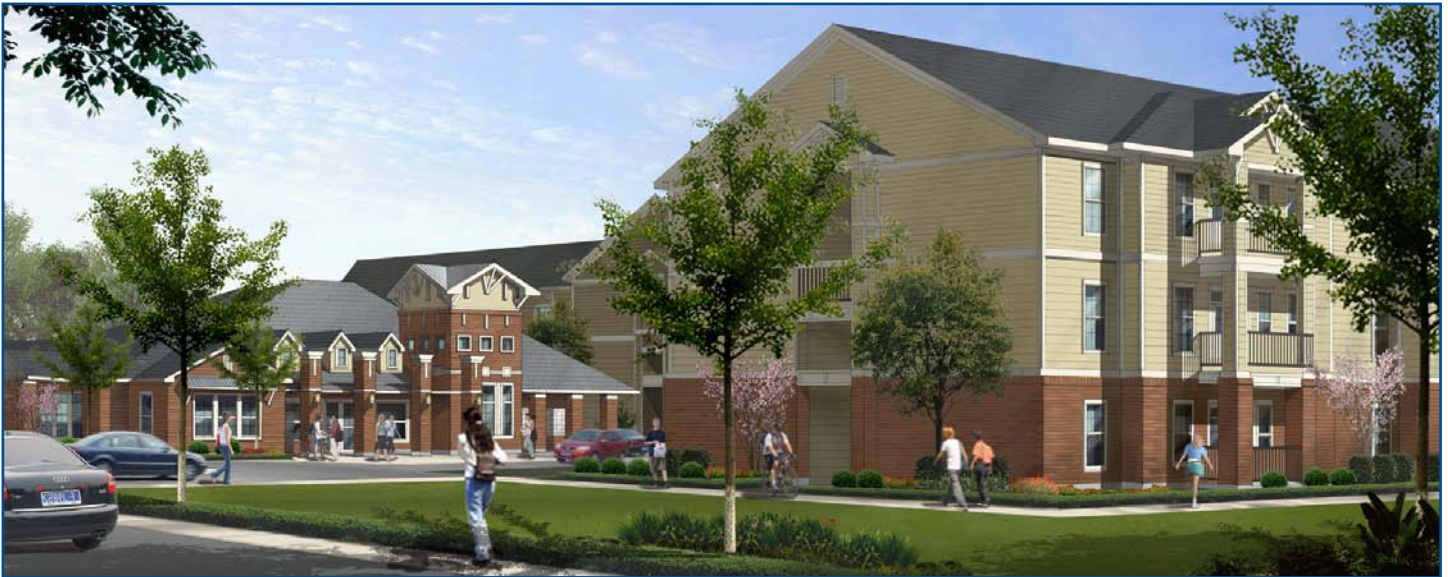
The above rendering of Place Properties will replace Coleman Dairy shown below to provide additional housing in the University District.