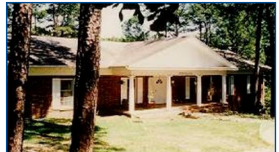
The Methodist Youth Home is located in the University District.

Technology. Public institutions and businesses located in the University District use broadband network facilities to provide conventional products, services and programs. Neighborhood residents have access to broadband services through conventional DSL or